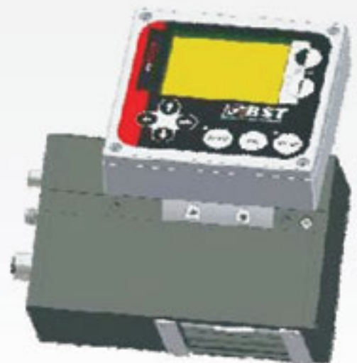
CLS Pro 600

The adjustable LEDs feature an extremely long service life and give ideal illumination which results in excellent web guiding results.