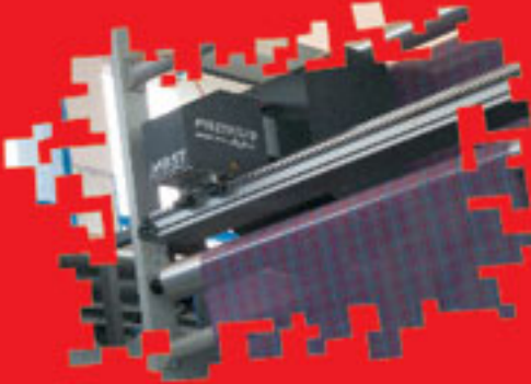
BST's "PREMIUS PRINT MANAGEMENT SYSTEM"